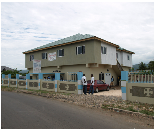
Church building located at 24 Sharpe Avenue . Constructed between 2005 –2008