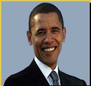
First Black President for U.S.A. Pres. Barack Obama

D o you get weary? Discouraged? Burnt out? Do you feel unappreciated? Of course! All Christians do at some time or the other. As we look toward the opportunities and challenges of year 2009, here's a little encouragement for you from the Apostle Paul: